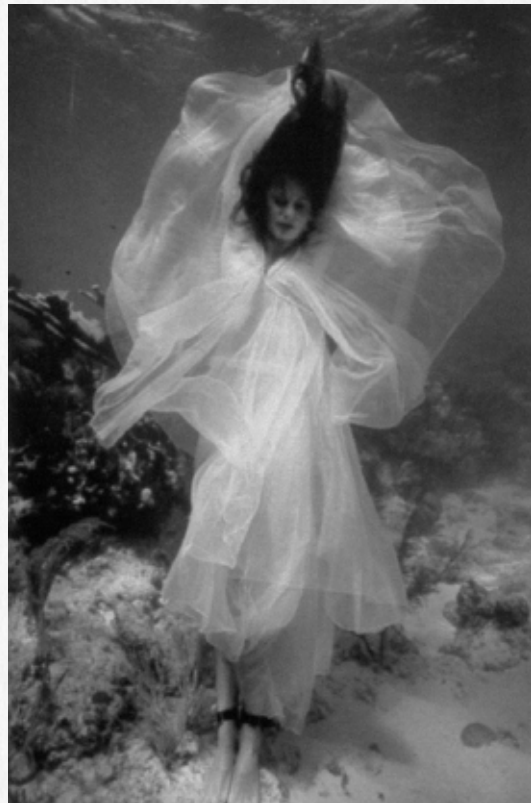
Hans Hass, Men Beneath The Sea

And the sister ... went and cast herself into the river and was drowned; and when the [other] sister perceived this ... she also secretly drowned herself.